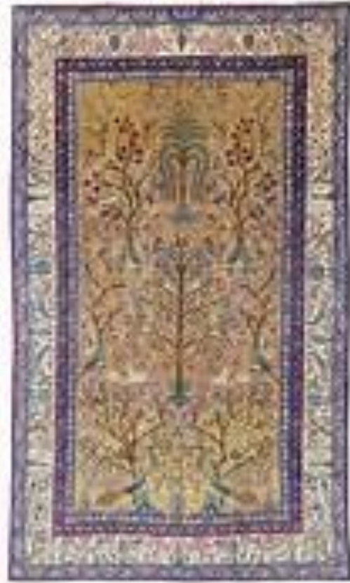
A Tehran Carpet, North Persia, Woven circa 1910 Wool

The beauty of today's Gospel reading is in John the Baptist's generosity of spirit. John the Baptist was a very charismatic person who drew people to himself. As a result, he had his own disciples. Yet, in this morning's gospel reading we find John directing two of his disciples away from himself and towards the one whom he proclaimed as the Lamb of God. As a result John's two disciples became disciples of Jesus. Having responded to John's invitation to go towards Jesus, they subsequently respond to Jesus' invitation to ' come and see '. John was not possessive about his disciples. On the contrary, he encouraged them to go towards someone else who had more to offer them than he had. This is love at its most generous. To love others in the way God loves them is to want what is best for them, and that will often mean letting them go to others who can help them to grow as human beings and as children of God in ways that we cannot.